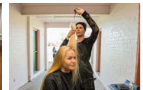
BELOW The hair-styling session was a big hit at Waminda's cancer pamper day

"Our success wouldn't be possible without our partner agencies – whether that's the Illawarra Shoalhaven Local Health District, Medicare Local, the Shoalhaven Women's Health Centre or the local Aboriginal Medical Service. It's really important that we continue to work in collaboration, as a large part of our role is to be a conduit between our community and other mainstream cancer care providers."