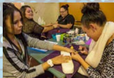
RIGHT Getting pampered helps South Coast women feel better about cancer screening