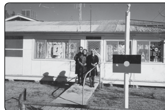
WAMS First Building