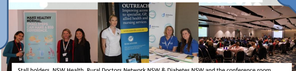
Stall holders NSW Health, Rural Doctors Network NSW & Diabetes NSW and the conference room

Info from stalls was also really relevant and helpful