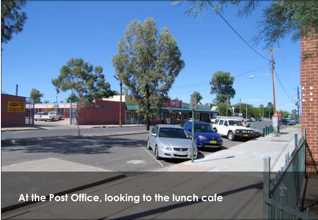
At the Post Office, looking to the lunch cafe