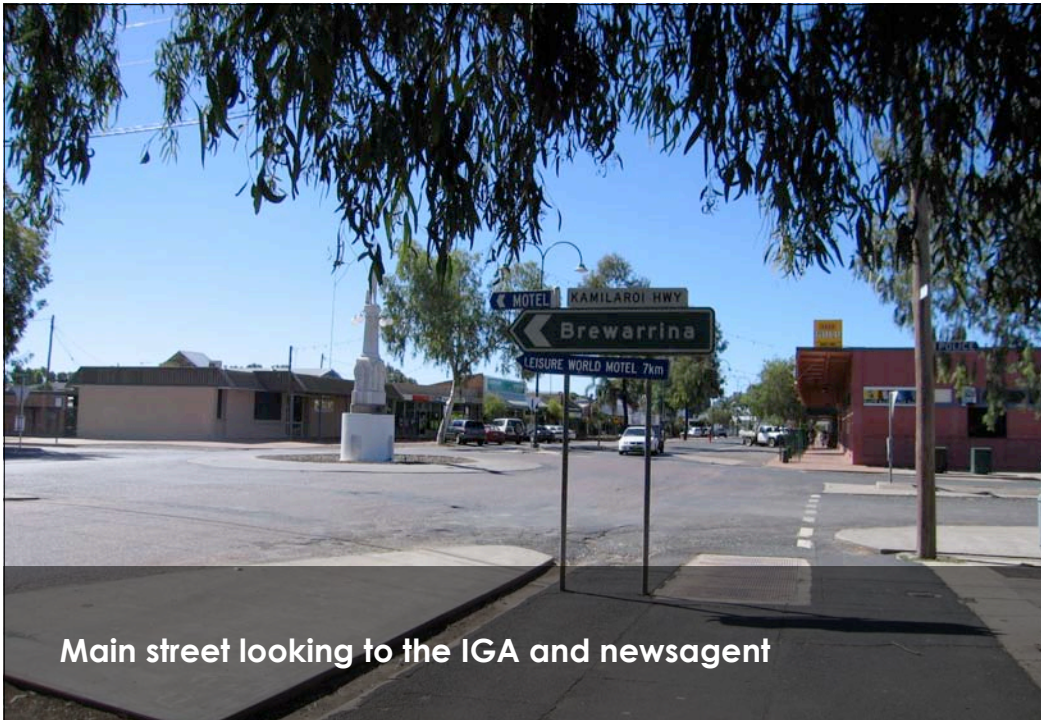
Main street looking to the IGA and newsagent